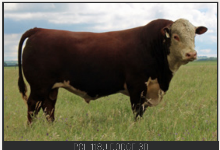
PCL 118U DODGE 3D