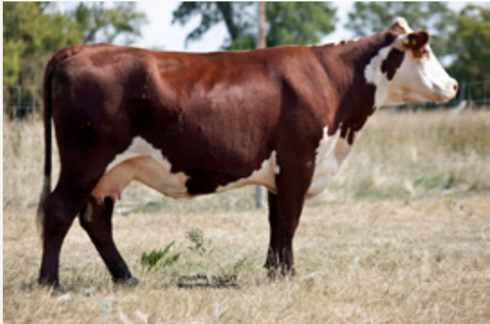
PCL MISS JADE 657G ET 37T