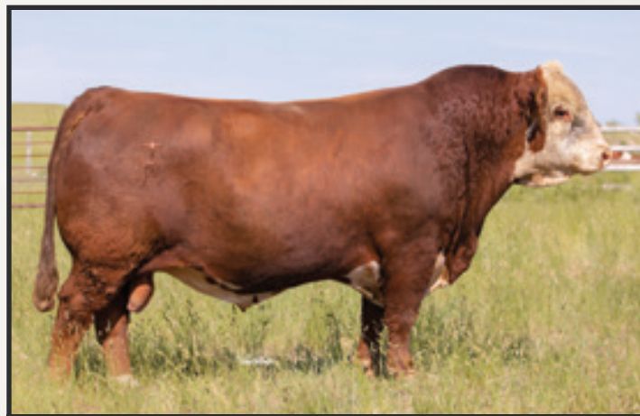
PCL 4013 GLITZ 1G