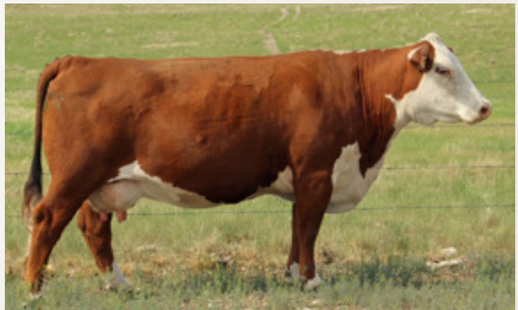
GHC MISS TRUST 54B