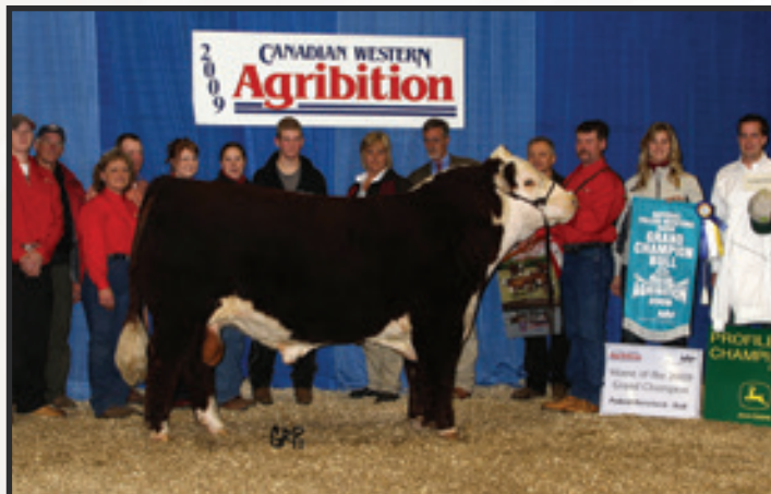
MHPH 101S UMPIRE 118U