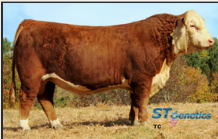
PCL 4013 GENESEEKER ET 22G