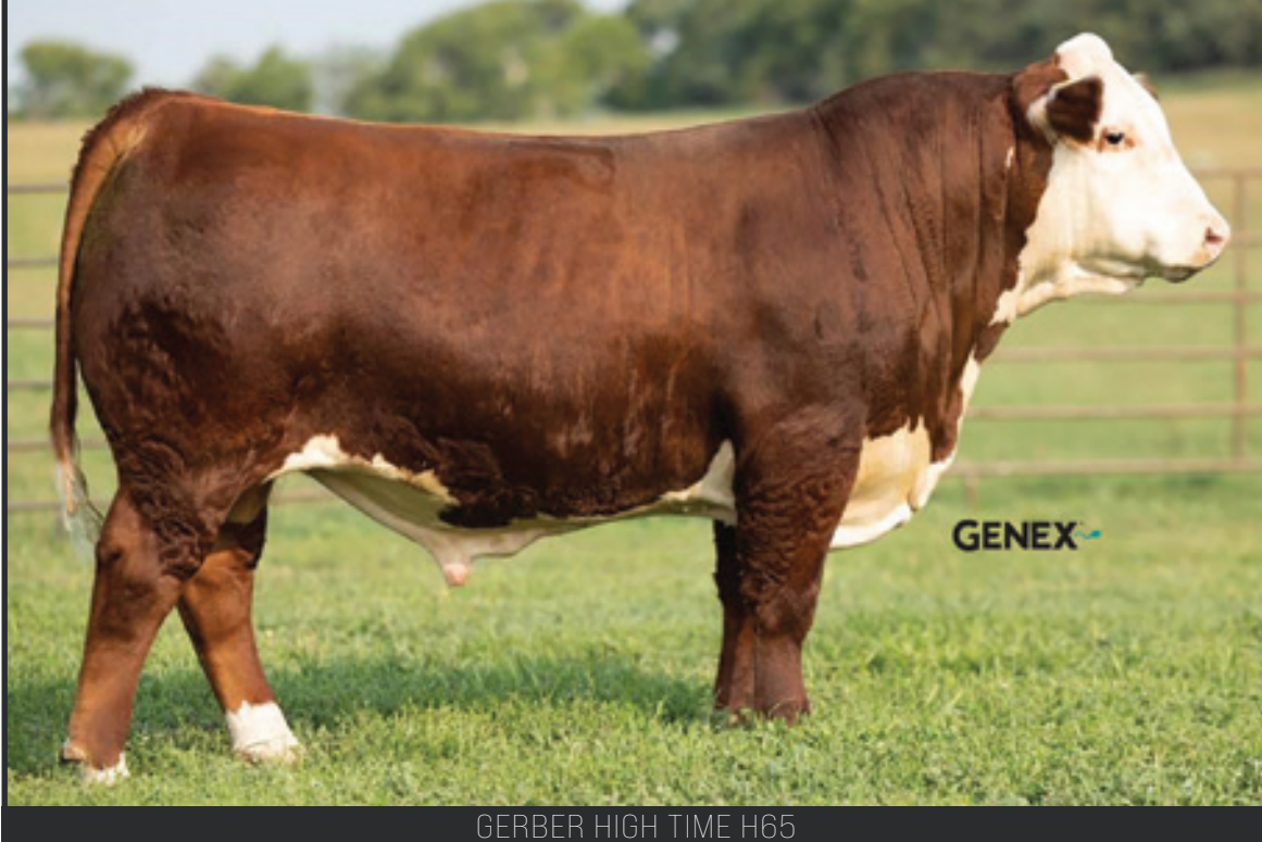
GERBER HIGH TIME H65