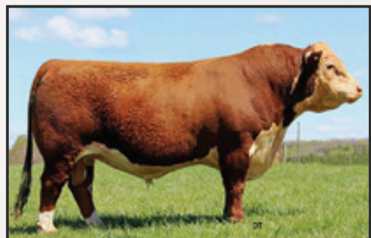
KCF BENNETT ENCORE Z311 ET