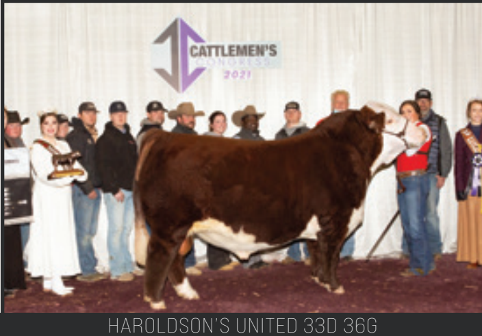
HAROLDSON'S UNITED 33D 36G