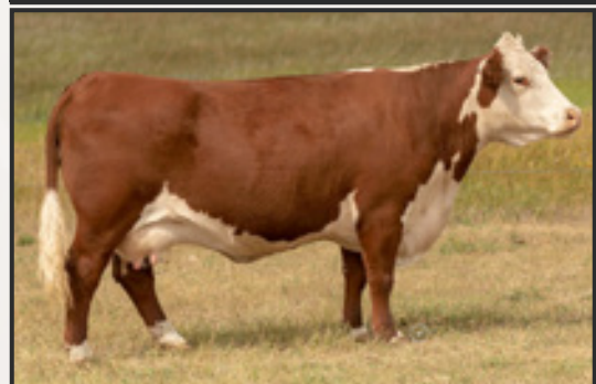
MHPH 101S LIBBY 128A