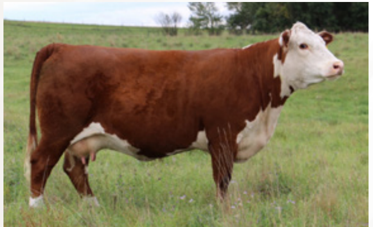
PCL Jade 57T 31Y