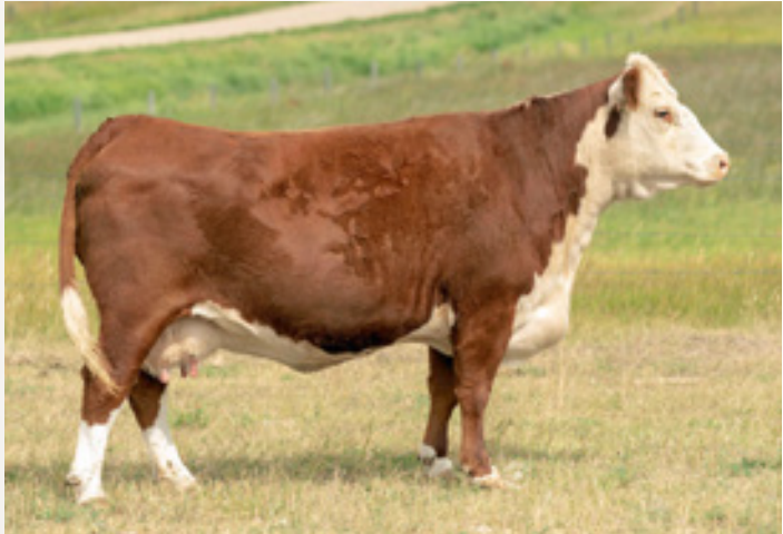
PCL REAL LADY 118U ET 17B