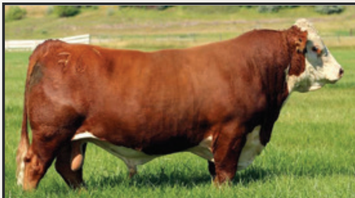
NJW 160B 028X HISTORIC 81E ET