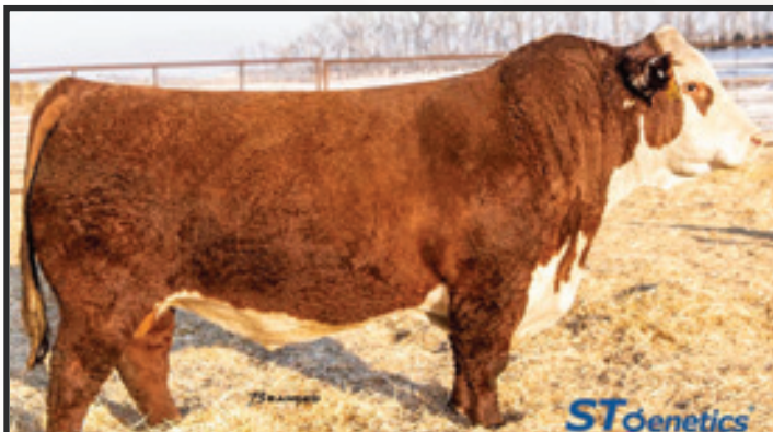
TH MASTERPLAN 183F