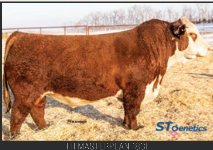
TH MASTERPLAN 183F