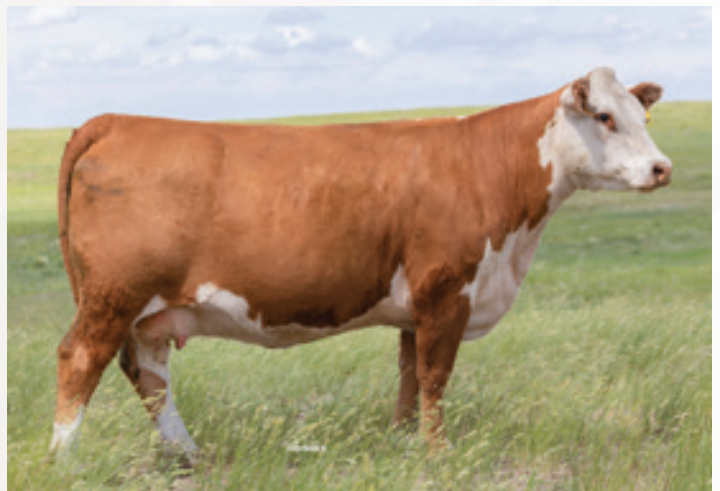
Dam PCL 6153 REAL LADY 29H